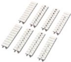
Zack marker strip, 10-section, vertically labeled with the consecutive numbers: 11 ... 20, white, width: 5 mm

Please be informed that the data shown in this PDF Document is generated from our Online Catalog. Please find the complete data in the user's documentation. Our General Terms of Use for Downloads are valid ( http://phoenixcontact.com/download )